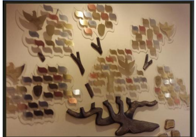
Temple Beth Torah Tree of Life Commemorate a Simcha!